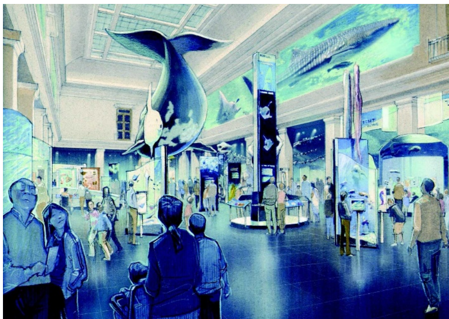
An artist's impression of the Sant Ocean Hall shows its emphasis on the oceans as a single ecosystem.